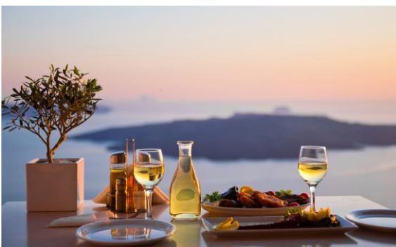
Greek Wine Roots