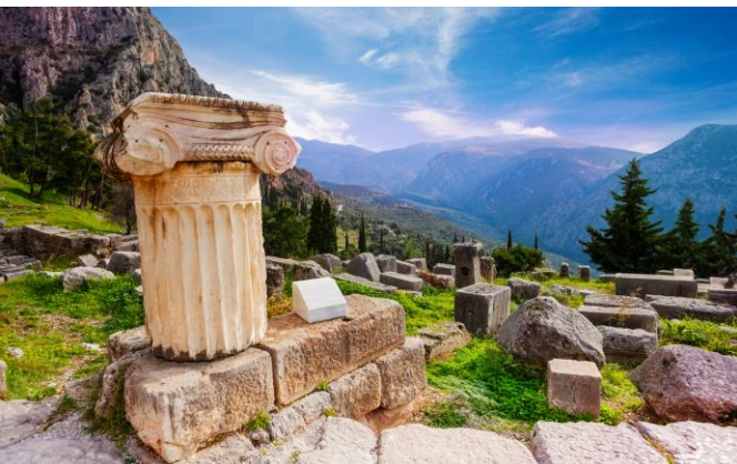
In the Footsteps of Saint Paul