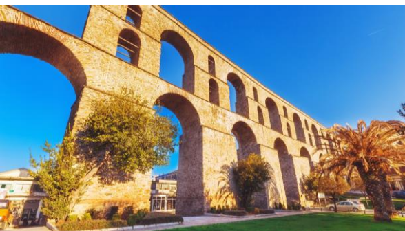
In the Footsteps of Saint Paul