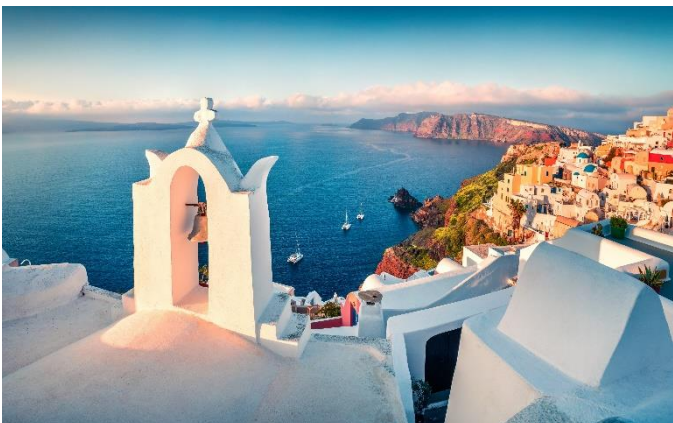
Athens & Central Greece